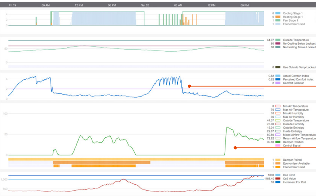
Snapshot from Facilisight of the 75F Outside Air Optimizer solution working in an area consisting of 16 zones.

When indoor air quality reaches a maximum threshold of CO2, the outside air damper will bring in fresh air to modulate the percentage necessary to achieve ideal comfort.