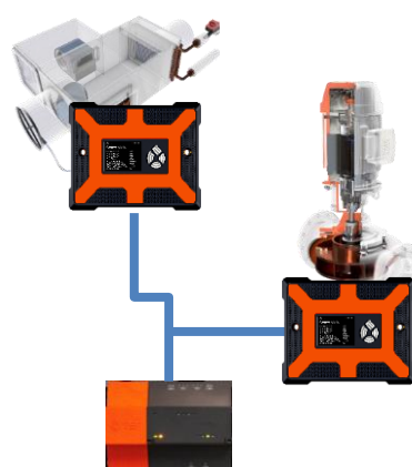
Independent Controller Configuration