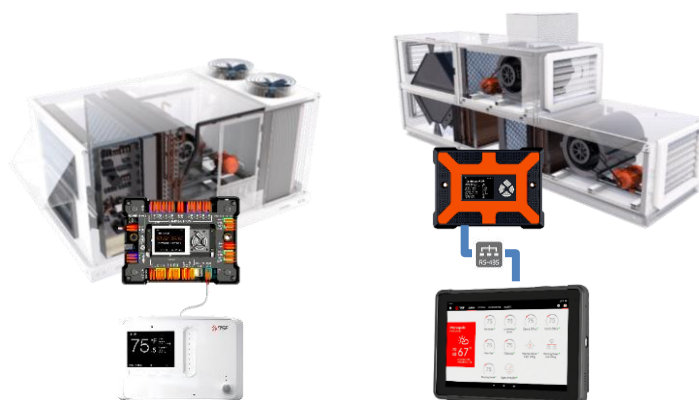
HyperStat Split Configuration