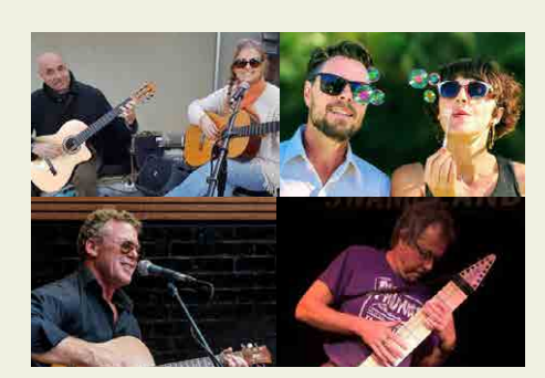
various artists sunday session

Friday 15 March 7pm – 8pm, Amphitheatre Stage