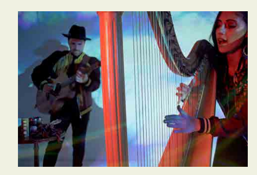
international women's day showcase performance