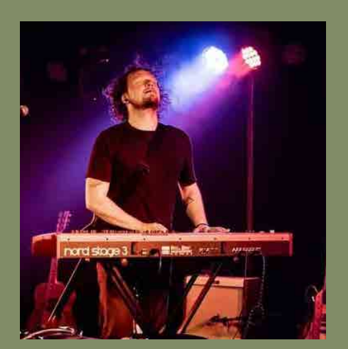
Millington Sunday 10 March 2pm – 5pm Bath House café stage