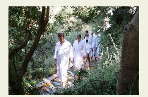
introduction to reflexology*

(Easter) Saturday 30 March 6pm - 8pm, Bath House Amphitheatre Sun Deck