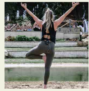
hot springs yoga Available daily 9.15am Amphitheatre Stage