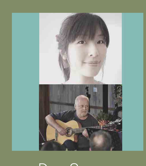
Duo Sarava Sunday 3 March 2pm - 5pm Bath House café stage

Local talent performing live every sunday in March