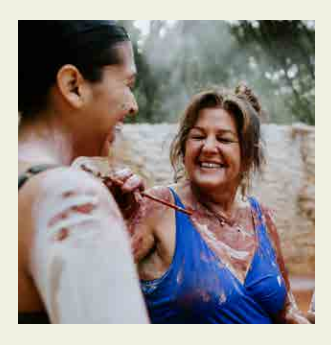
body clay Available daily 10.30am, 12pm**, 1pm & 3pm Clay Ridge