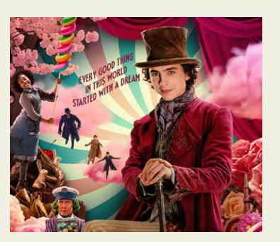
bathe in cinema Wonka Thursday 18 April 7:30pm, Amphitheatre