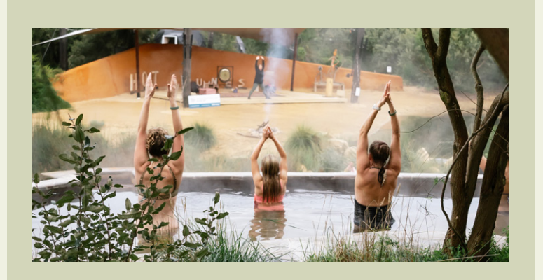
family Friday 29 March, 5 & 12 April 10:30am & 11:15am yoga Amphitheatre Stage