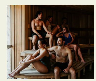
sauna infusion* Available daily 12pm Fire & Ice area