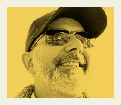
sundeck DJ sessions Saturday 30 March & 6 April, 5:30 - 7:30pm, Saturday 13 April, 4:30 - 6:30pm, Amphitheatre Sundeck