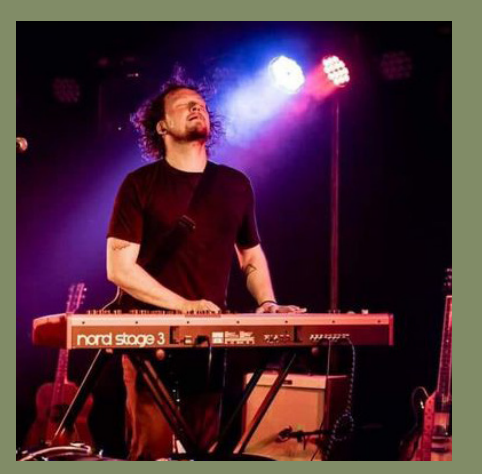
Millington Sunday 14 April