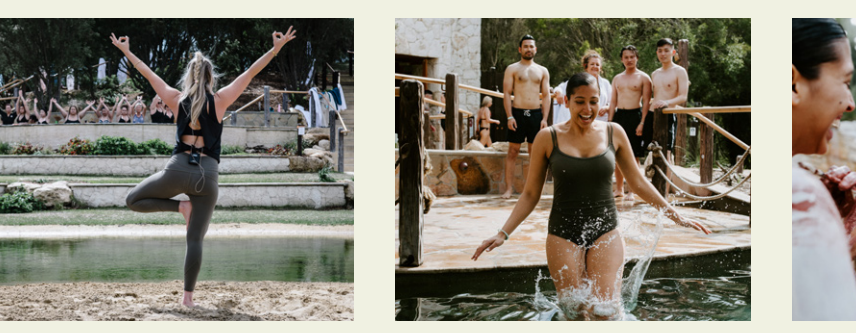
hot springs yoga Available daily 9.15am Amphitheatre Stage