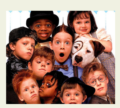
bathe in cinema Little Rascals Thursday 4 April 7.30pm Amphitheatre stage