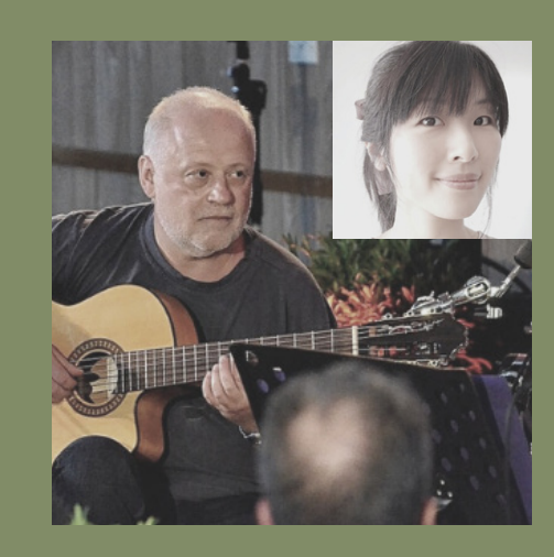
Duo Sarava Sunday 7 April