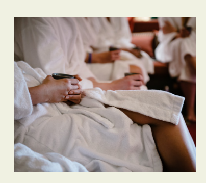
tea ceremony* Available daily 12pm Tea Tent