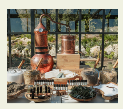
apothecary workshop* 6 April 11am - 12:15pm Maroon Hoods Glass House $60pp with take-home product