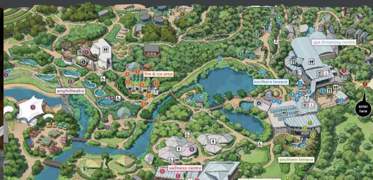
download our map