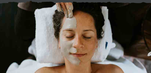
what to expect