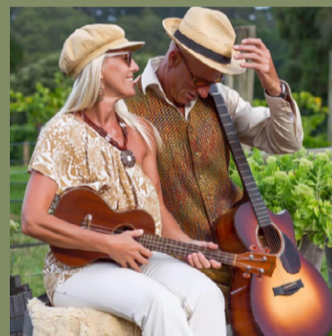
The Calmer Miles Sunday 20 October