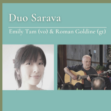
Duo Sarava Sunday 6 October