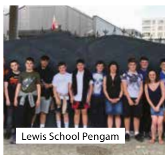
Lewis School Pengam