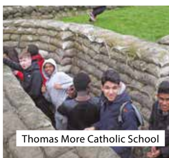
Thomas More Catholic School