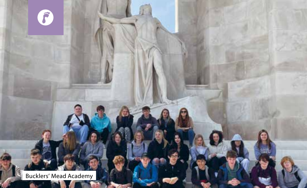
Bucklers' Mead Academy