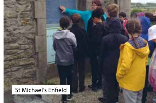
St Michael's Enfield