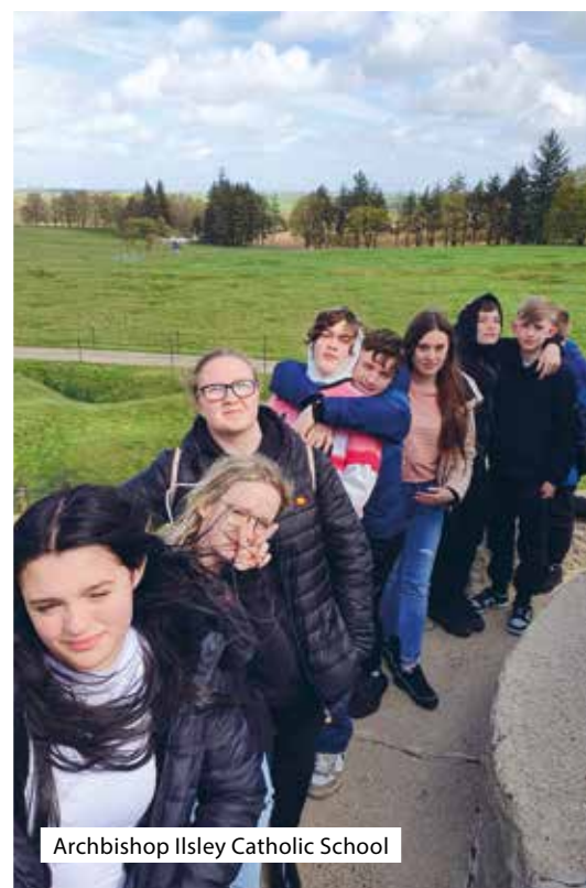
Archbishop Ilsley Catholic School