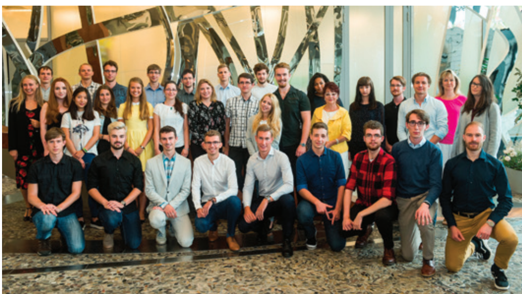
The Kellner Family Foundation's Universities project grantees meeting in August 2017