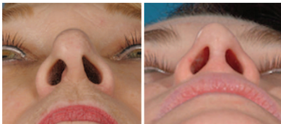
Fig. 3. Note the angle of the basal surface of the alar rim between the tip subunit and the alar base. This should ideally be straight, but the concavity noted in these examples is defined as alar collapse.

and postoperative complications. Three blinded plastic surgeons then evaluated primary rhinoplasty patients' results via standardized preoperative and postoperative photographs in sole regard to the alar aesthetics. The photographs were evaluated for differences between degrees of alar retraction, notching, collapse, and asymmetry from anterior, lateral, and basal views. All photographs ranged from 12 to 34 months of follow-up, with a mean follow-up of 15 months. All data categories were graded on a four-point scale: severe, 4; moderate, 3; minimal, 2; and none, 1. Differences between postoperative changes and scores were compared and statistically analyzed via paired t test.