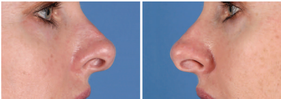
Fig. 1. Patient example that demonstrates alar retraction. The smooth but elevated contour of the alar rim on the lateral view when compared with the long axis of the nostril is defined as alar retraction.

A retrospective chart review was conducted on an institutional review board–approved database of patients who underwent rhinoplasty between 1996 and 2013 by a single surgeon. Fifty consecutive patients who were followed for at least 1 year were selected from the later subset (2006 through 2013), during which the surgeon performed alar contour grafts on all patients who underwent primary rhinoplasty. Fifty patients from prior to 2006 who did not receive alar contour grafts were then used as controls. Any patients who had received previous nasal surgery for trauma or tumor resection were excluded from the study. The retrospective chart review included patient demographics