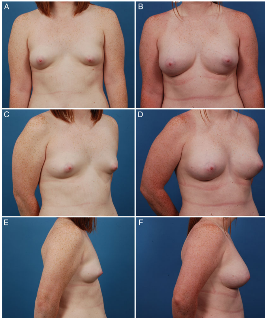
Figure 2. Preoperative (A, C, E) and 1-year postoperative (B, D, F) photographs of this 20-year-old woman with a constricted lower pole. Her right breast measurements were sternal notch-to-nipple, 20.5 cm; nipple-to-IMF, 8 cm; and breast base width, 12 cm. Her left breast measurements were sternal notch-to-nipple, 21 cm; nipple-to-IMF, 6 cm; and breast base width, 12 cm. She received a bilateral breast augmentation with 295cc Mentor (Santa Barbara, CA) contour profile gel style 322 silicone implants and 3-point suture technique.

did not increase operative time, implant trauma, operative bleeding, or postoperative recovery. Postoperatively, patients did not complain of increased pain or IMF distortion. Long-term studies are needed; but anecdotally, implant malposition has been less than 1% with this surgical adjunct in this high-risk population. Prior to 2010, the incidence of implant malposition was 3% in this cohort.