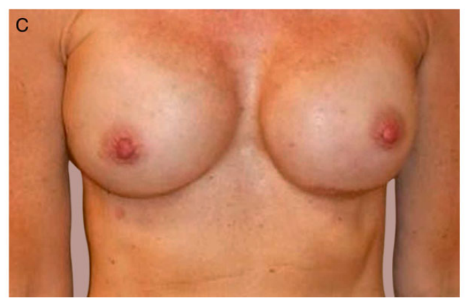
Figure 3. A 47 year-old female with history of prior subpectoral silicone augmentation (5 years prior) status post bilateral NSM for left-sided DCIS. Two-stage reconstruction was performed with 480 cc silicone implants. Patient shown preoperatively (A), intraoperatively at the time of tissue expander placement (B), and one year postoperatively (C).