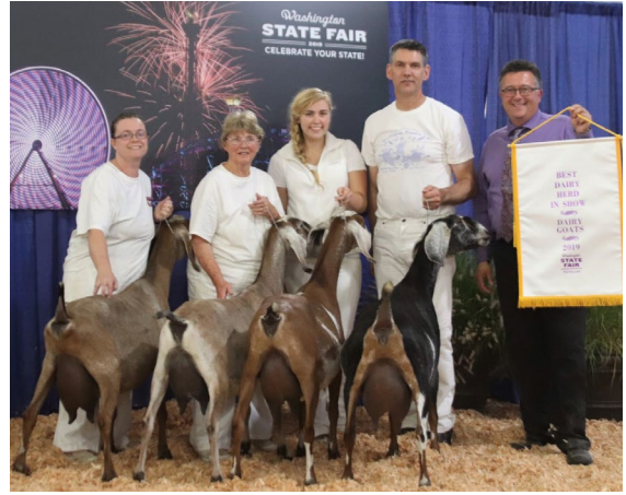
2019 Best Dairy Herd in Show