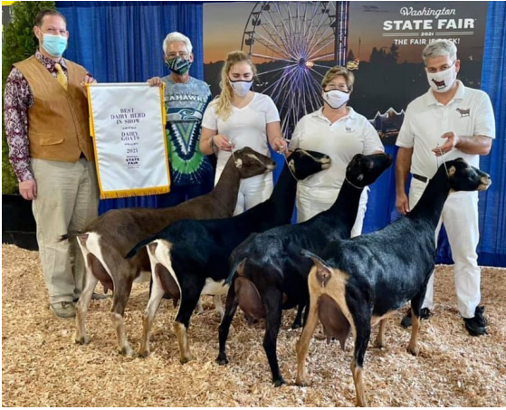
2021 Best Dairy Herd in Show