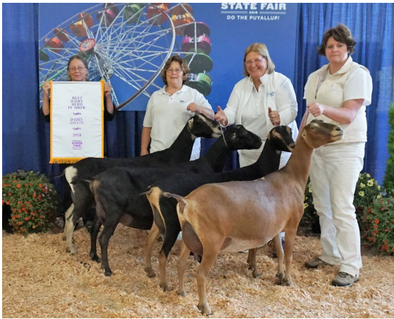
2018 Best Dairy Herd in Show