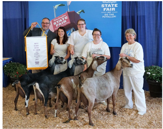
2017 Best Dairy Herd in Show