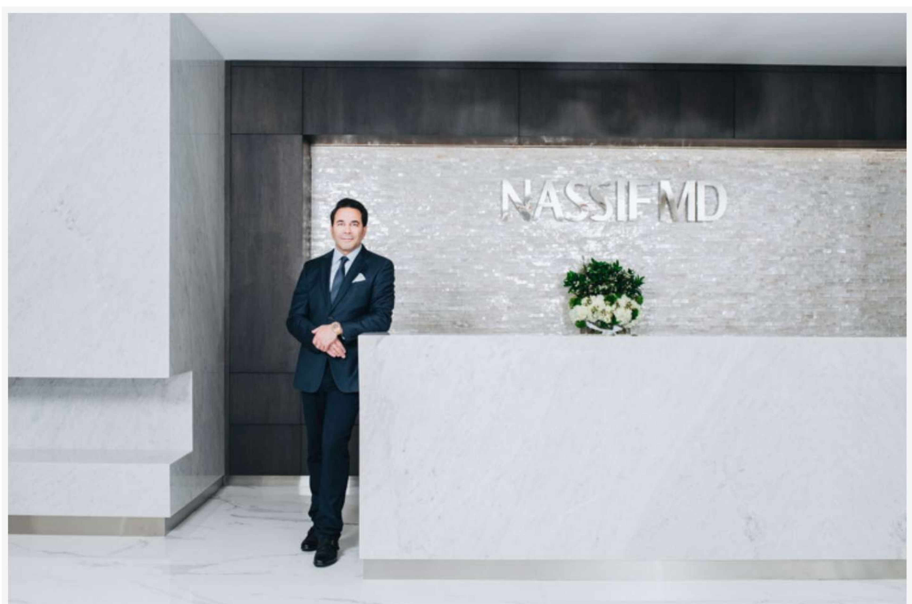
Dr. Paul Nassif

If rhinoplasty isn't in the cards but you still want to experience the magic hands of Dr. Paul Nassif —plastic surgeon extraordinaire and star of the hit E! series, “ Botched ,” you need only book an appointment at his brand new Beverly Hills medspa.