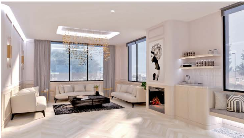
Main Lobby (Above)