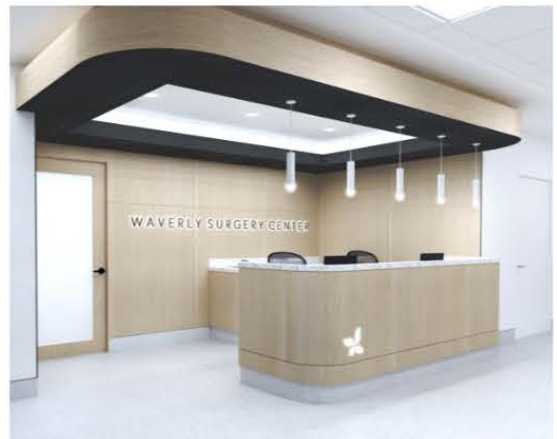
Surgical Check in (Above)