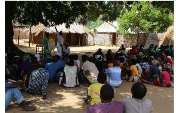
World Aids Day event co-hosted by Syrah including health awareness program.