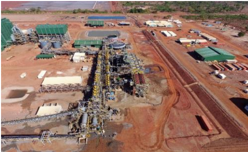
Balama plant site.