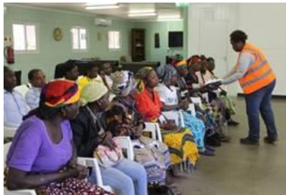
Local community site visit.