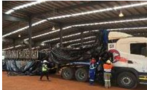
Loading product on first truck to Port of Nacala.