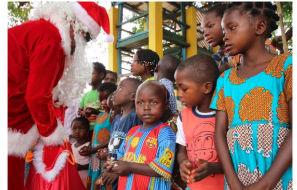
Seasonal celebration and gift giving to Balama orphanage.