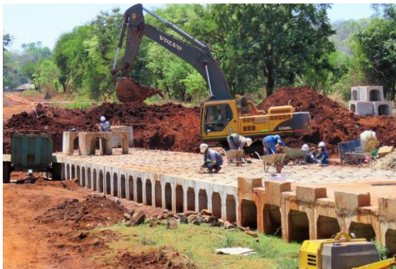
Chipembe Dam installation of concrete culvert on spillway.