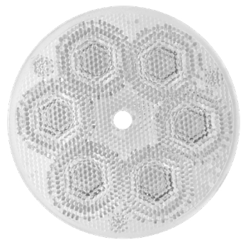
15° / 30° / 60° Replaceable Lens