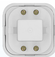
4-Pin G24 Base