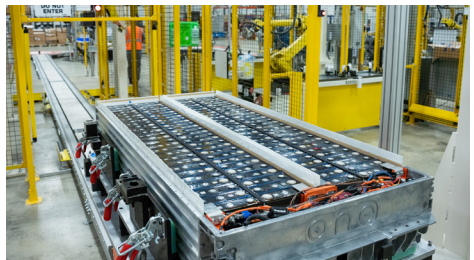
Aries LFP production line at Piston Automotive