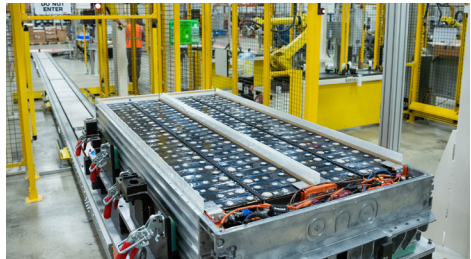
Aries LFP production line at Piston Automotive.