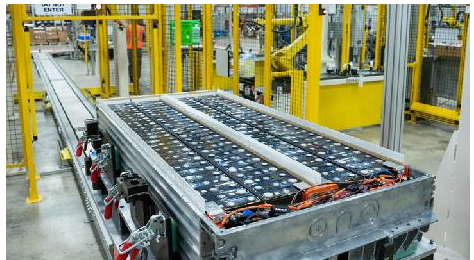
Aries LFP production line.