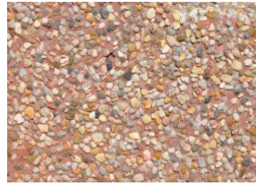
River stone colored red