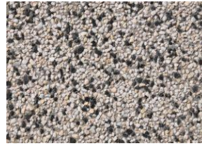
Grits white-black 1