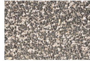
Grits black -white 2