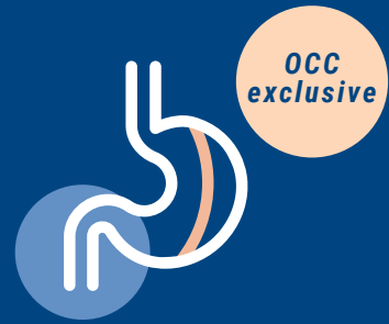
Improved Gastric Sleeve® Double Buttress Technique