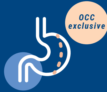
Plication / Stomach Sparing Gastric Sleeve®