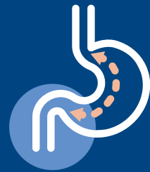
Mini Gastric Bypass