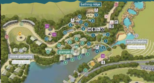
download our map