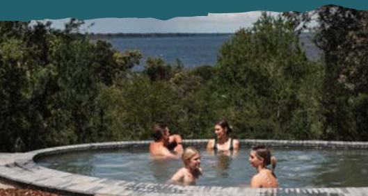
what to expect