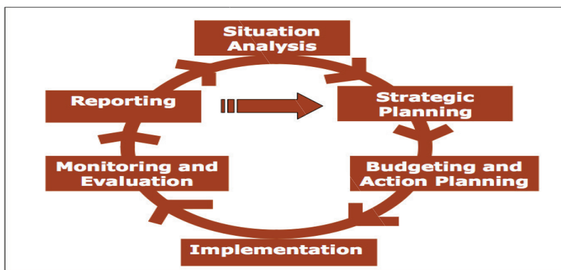
Figure 1: Government Planning and Budget Cycle

The FYDP II M&E Strategy will produce a number of reports including: Dialogues Reports, Budget Monitoring Reports, Evaluation Reports, Mission Reports for Project Inspection and other reports as deemed necessary by stakeholders. The reports will be in line with the Government Planning and Budget Cycle shown in figure 1 below.