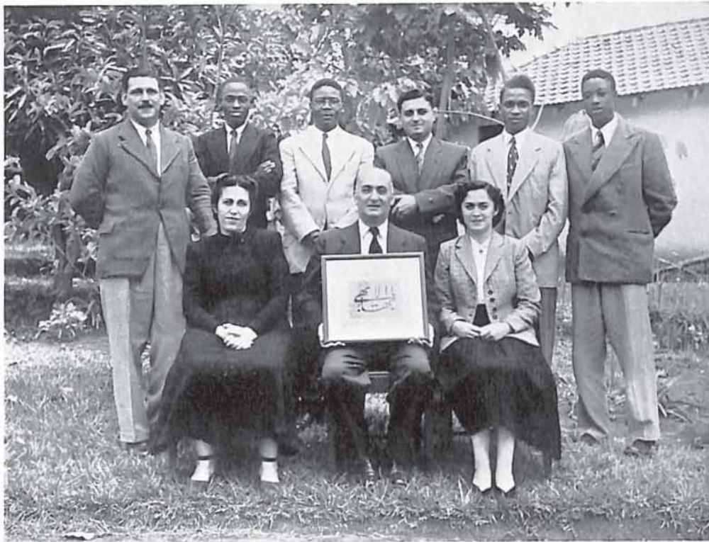
FIRST LOCAL SPIRITUAL ASSEMBLY of KAMPALA UGANDA