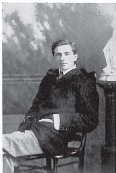
Thomas Breakwell, the first English Bahá'í