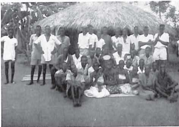
Bahá'ís in front of temporary Centre, Kobiom