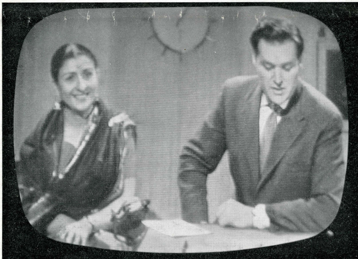
An Interview on I.T.V. News Bulletin