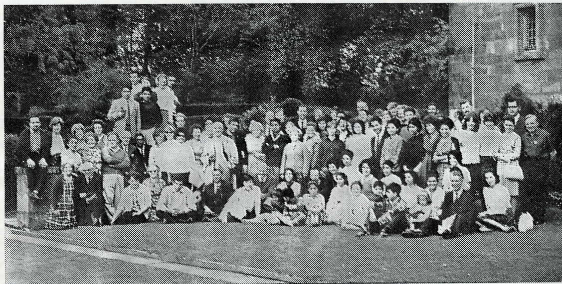
Dalston Hall Summer School, 1964.

Once again, Dalston Hall and environs over-spilled happiness, love and laughter. Two weeks evinced a timelessness as the friends assembled, and in prayer, meditation and activity "welded themselves into one heart." It could be truly said we were in the place, 'Therein no toil shall reach us, and therein no weariness shall touch us;' 'no vain discourse shall they hear therein, nor any falsehood, but only the cry, "Peace! Peace!"'