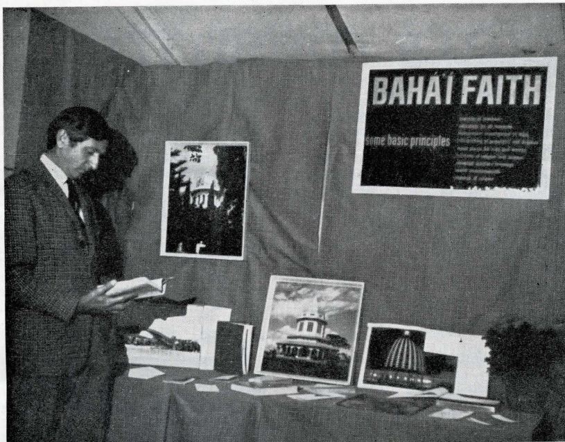
Bahá'í stand at Brent show