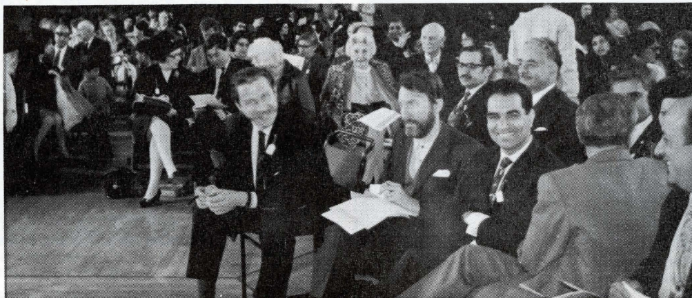
Delegates and visitors during a break.