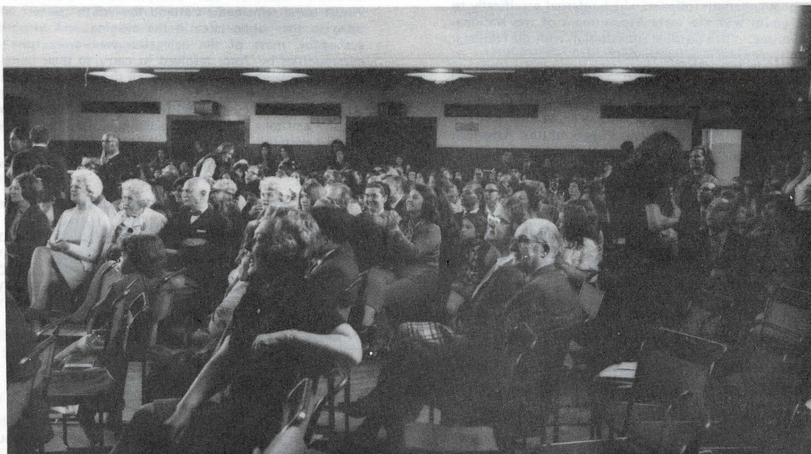
Visitors to Convention

"The Stieng new minority group Cambodian border Bihllong Province joining Faith by hundreds. Expecting thousands new Bahá'ís in this Province before Riḍván."