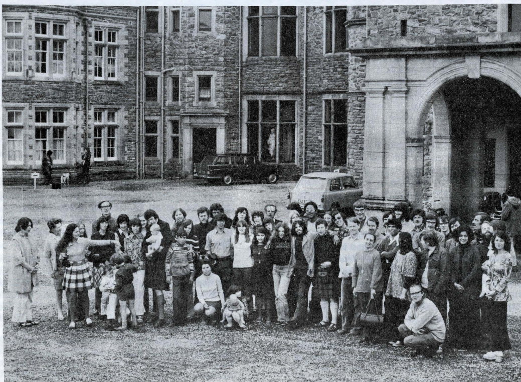
Some of the friends who attended the Summer School at Carbisdale Castle, which preceded the "Islands '73" Project.

After the lady indicated her desire to become a Bahá'í, she was shown a picture of 'Abdu'l-Bahá. She became agitated and said He was the one of her dream. The believers were invited to visit her home where she read Bahá'í prayers aloud as if the words were those she had always known.