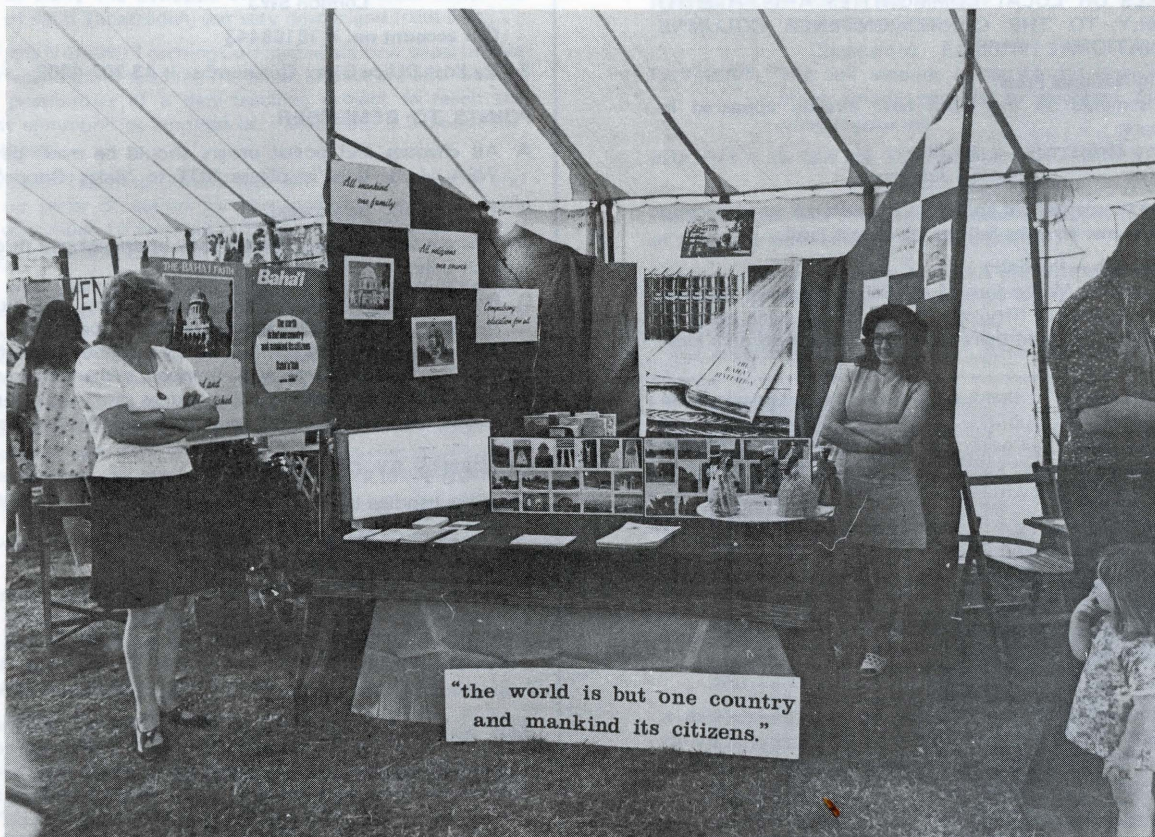
The Bahá'í stall at the Cambridge Fair.

On the weekend of 1/2 September, the Guildford community manned an exhibition at the Town Show, a very well supported annual event in the town. Friends came from Crawley, Brighton, Southampton, Hove and the Isle of Wight to help answer questions. There was a considerable amount of interest, markedly more than when we attempted the same thing two years ago; several people had seen Dizzy Gillespie on television a few nights before. Others had met the Bahá'ís in the Middle East, and expressed surprise at finding us in an English country town. One man, who had been serving with the Jordanian Police, had met Shoghi Effendi in 1936. All in all, we were very pleased and excited about the interest shown; a nice final touch was when we were awarded second prize for the best non-commercial display.