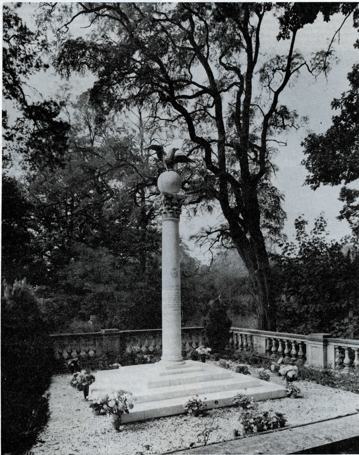
A recent photograph of the memorial column at the grave of the beloved Guardian, Shoghi Effendi, in London.