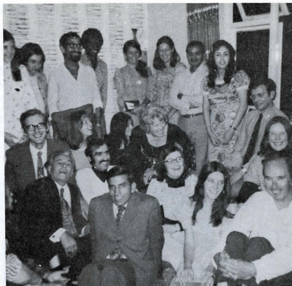
Bahá'ís attending a celebration in Guildford

£4.25 (including postage — cheques payable to Social Documents Ltd).