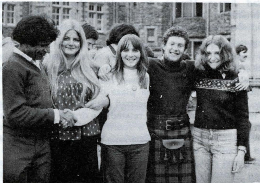
A group of young Bahá'ís photographed at Carbisdale Castle just before setting out to teach in the "Islands '73" Project.