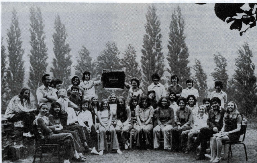
Junior youth and their tutors who attended the weekend gathering at "Treen", in Leeds.