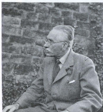
Bernard Leach Companion of Honour

STORNOWAY: Intensive and extensive teaching has taken place during the past months — prayers have been said in sixty villages and active teaching has taken place in over fifty. In some villages, when going from door to door to invite people to a public meeting, up to 400 houses have been visited and there have been many cases of group teaching. More public meetings and firesides are planned and the whole teaching process is gathering momentum.