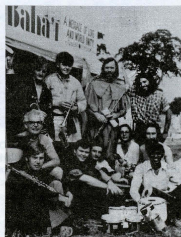
Some of the friends who helped at Waveney.

WAVENEY: A successful teaching project took place at a Medieval Faire in Barsham, Suffolk. It was primarily a crafts faire which consisted of a craft-market situated in a delightful meadow. Many traditional amusements were also to be found. All the friends agreed that the atmosphere of the faire was beautiful and extremely conducive to teaching. Over thirty thousand people attended the faire over the August Bank Holiday weekend. Friends from Peterborough, Kent, Richmond, Norwich, Northampton, Ilford and Newmarket helped to man a small marquee which housed a very simple exhibition expounding the stations and writings of the Báb, Bahá'u'lláh and 'Abdu'l-Bahá. Large colourful photographs of the Holy Shrines were displayed to great effect. A comprehensive collection of books and pamphlets was also displayed, many of which were purchased by non-Bahá'ís. In the evenings a camp fire was built and many people came and joined in the 'Firesides'. Throughout the days and evenings four young Bahá'í musicians, from Kneller Hall Army Music Academy, and the Waveney Bahá'ís presented the Faith through music. These musicians were invited by the organisers of the Faire to perform on the main stage. An audience of about 200 joined them in a chorus of unity which continued for twenty minutes. Waveney Bahá'ís thank all who supported.