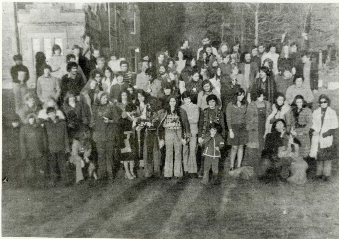
WISTON WINTER SCHOOL, SCOTLAND, 1973/4

Was it a gathering of talented artists, of teachers and students of non-Bahá'í religions, of perfectionist cordon bleus, of expert dancers, or was it just a Bahá'í winter school?