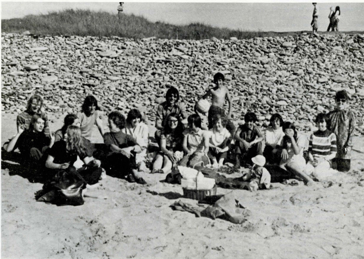
Travel teaching is fun! Most of the members of two teams which visited Orkney, together with some of the local Bahá'ís.

Despite opposition from some political and some other evangelical students, mainly in the form of defacing of Bahá'í posters on the notice-boards, the University firesides have been