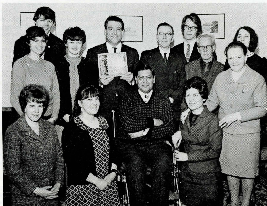
The Ridván meeting for the election of the first Spiritual Assembly of Kirkwall, Orkney.

There had already been the heartening declaration just before Christmas of the secretary's nephew, but to the regret of the Group he had to leave for Barcelona the day after the meeting, and will be living there for the present.