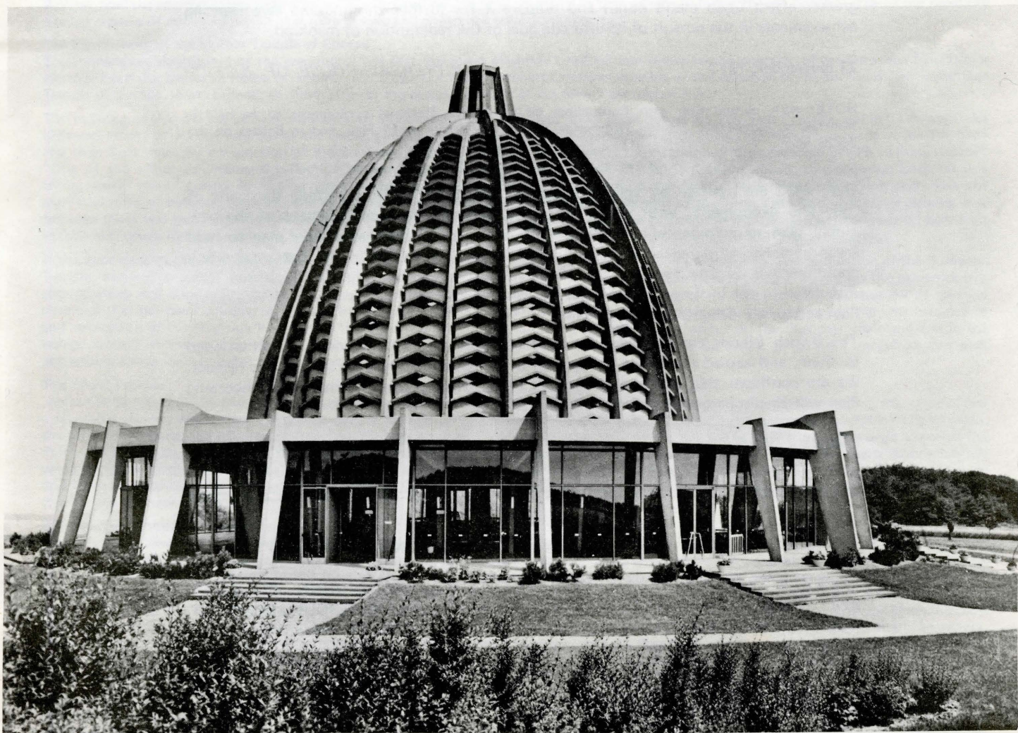
THE MOTHER TEMPLE OF EUROPE Langenhain, Germany