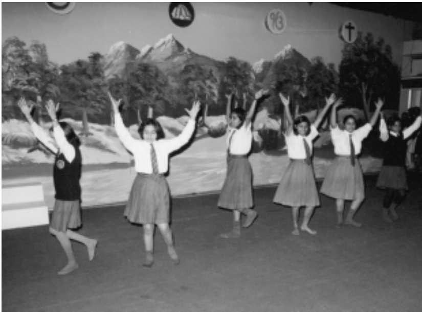
At City Montessori School, the arts are emphasized, as are moral themes that stress globalism and interfaith harmony. Shown here is a group of primary school students in a dance class at the Gomti Nagar branch.