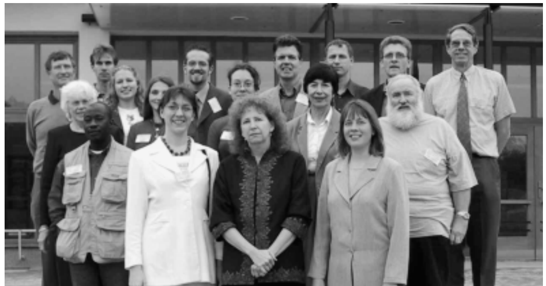
Members of the International Environment Forum, at their fifth annual conference held November 2001.