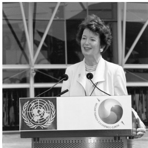
Mary Robinson, UN High Commissioner for Human Rights, acted as Secretary General of the World Conference against Human Rights, held 31 August–8 September 2001 in Durban, South Africa.

Some human rights specialists said that the language on the issue of slavery and its legacy