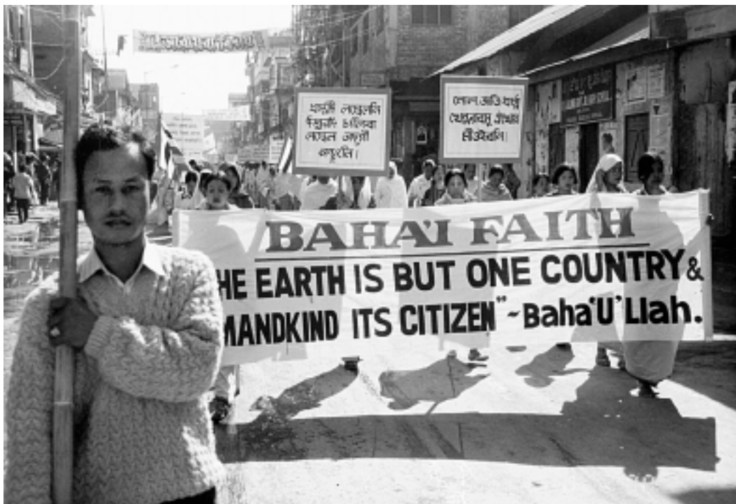
In India, Bahá'ís have long promoted intercommunal harmony.

around them, using a wide range of non-violent and peaceful means. These activities include work with the United Nations and its agencies, with governments and like-minded non-governmental organizations and religious groups; educational initiatives; media-based outreach campaigns; grassroots initiatives; youth workshops; and individual initiatives that encompass a variety of innovative and creative approaches to local problems and concerns.