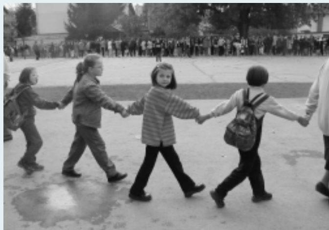
Students at the Third Primary School, Ilidza, making a human circle of peace in October 2000.

During its first two years, the project is focusing on six schools in three areas of Bosnia and Herzegovina: the Third Primary School, Ilidza, Sarajevo Canton; the Second Gymnasium, Sarajevo, Sarajevo Canton; the Ivo Andrić Primary School, Banja Luka, Republika Srpska; the Gymnasium, Banja