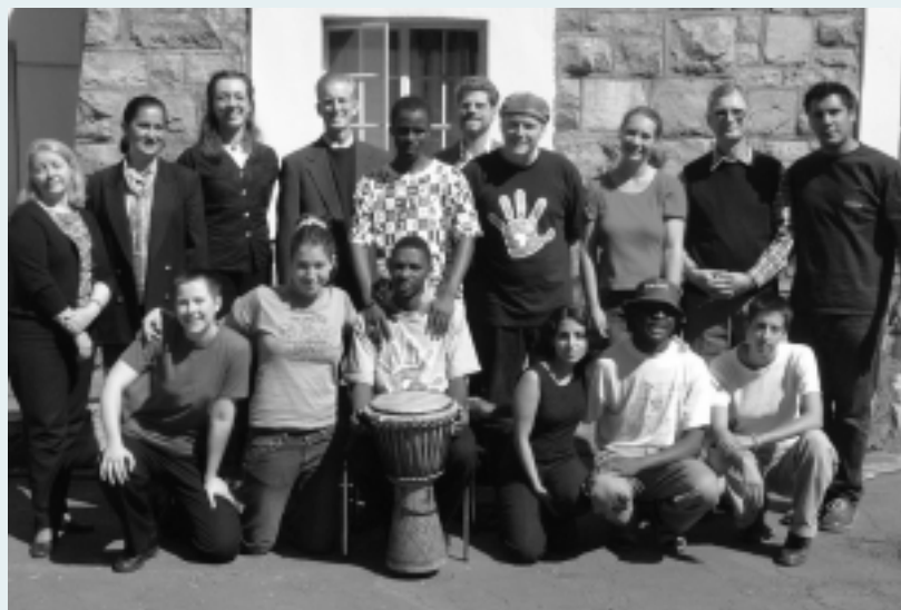
More than 30 representatives of six Bahá'í and Bahá'í-inspired organizations were accredited to the Johannesburg Summit. Some posed here for a group photograph.