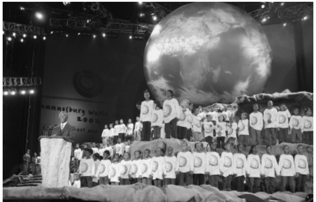
South African President Thabo Mbeki welcomes delegates to the World Summit on Sustainable Development at the Ubuntu Village on 25 August 2002.