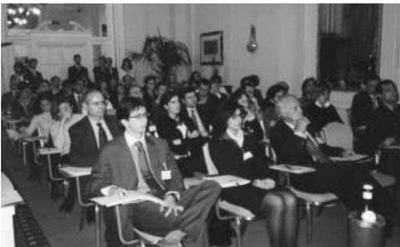
The first annual conference of the EBBF's Italian branch, held 11 May 2002 in Milan.