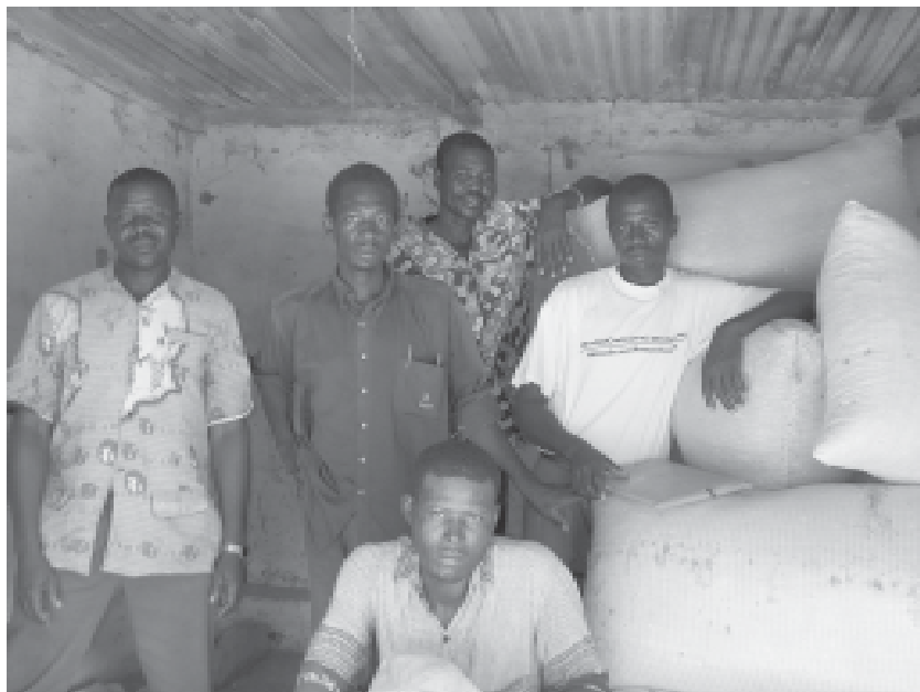
In the village of Waltama, the men's group has organized a village granary, which enables villagers to store grain until the market price is highest.

their success. The creation of a village granary exemplifies that spirit, said Michel Miramadjingaye, who is president of the Waltama group.