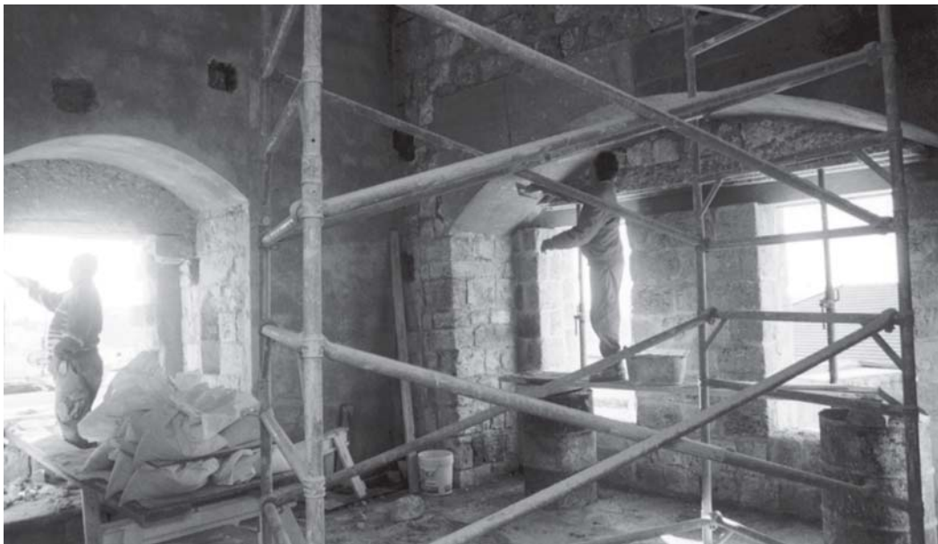
The restoration work in the room once occupied by Bahá'u'lláh. Many measures were taken to ensure the sacred and historic character of the citadel was respected.