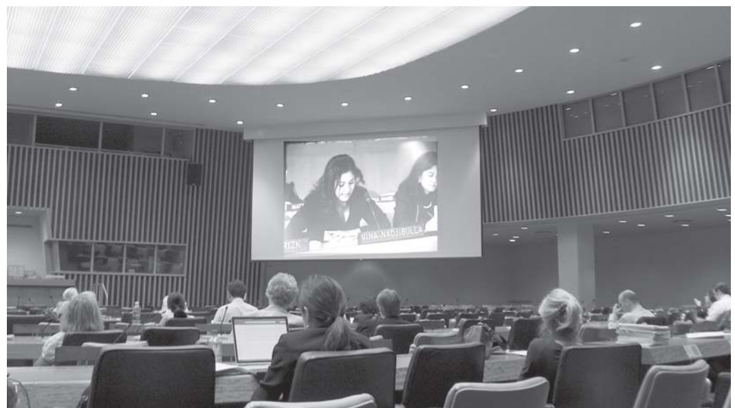
An overflow crowd in the main hearing room forced many civil society representatives to watch the historic “Informal Interactive Civil Society Hearings” on video monitors in other UN conference rooms.