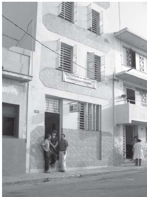
The newly reconstructed Bahá'í center in the heart of Havana.