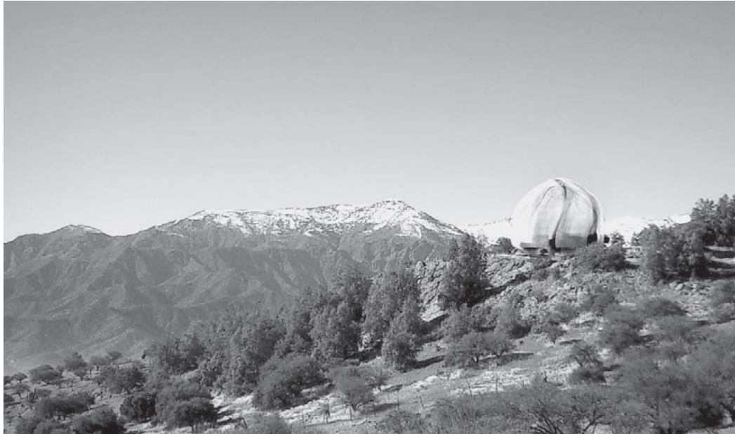
A model of the Bahá'í House of Worship for South America superimposed on a photograph of its planned site north of Santiago, Chile.

SANTIAGO, Chile — Though ground has not been broken and its projected completion is still three years away, the Bahá'í House of Worship planned for this city has already drawn accolades from more than 40 international architectural and design journals from as far as Italy, Germany, Australia, and Russia.