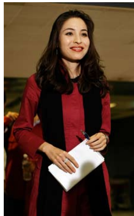
Roxana Saberi at a news conference in May 2009 after her return to the United States.

Ms. Saberi's description of the conditions facing the two Bahá'í women offers considerable insight into what it is like to be unjustly incarcerated in Iran today — a situation experienced not only by Bahá'ís, but by hundreds if not thousands among the journalists, women's activists, human rights