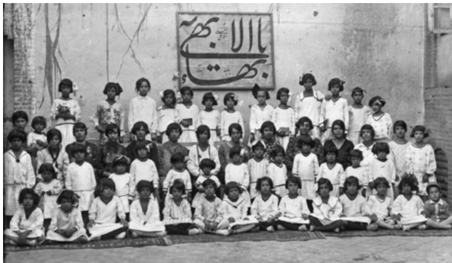
An image from The Forgotten Schools : The Bahá'í-run Tavakkul Girl's School in Qazvin, Iran, 1928.