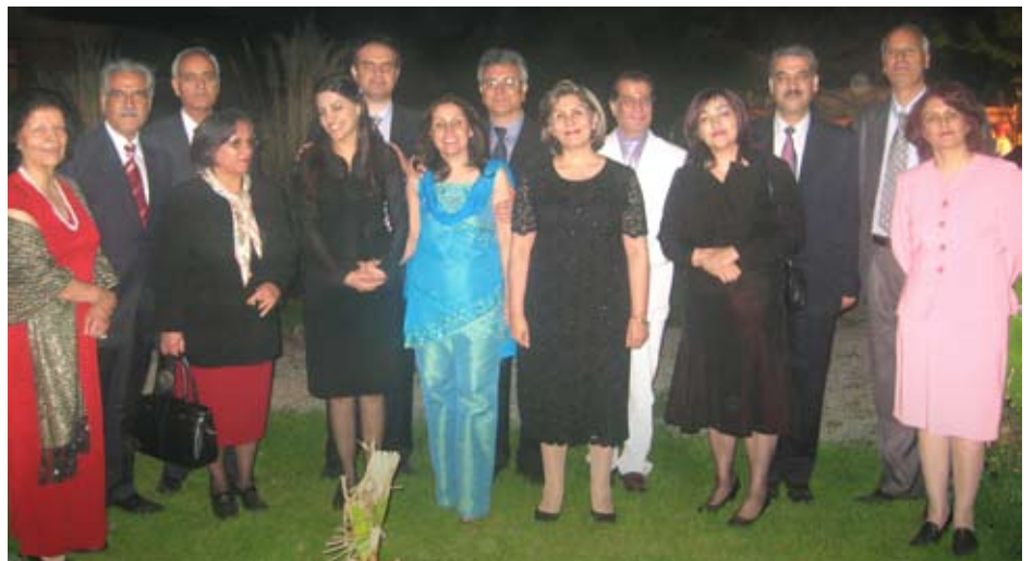
An undated photograph of the seven Bahá'í leaders currently held in Evin prison, taken before their imprisonment, with their spouses.