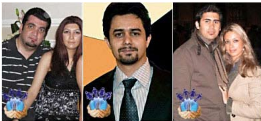
Above are photographs of some of the 10 Bahá'ís arrested on 3 January 2010, according to the Committee of Human Rights Reporters, which published the photographs on the Web.