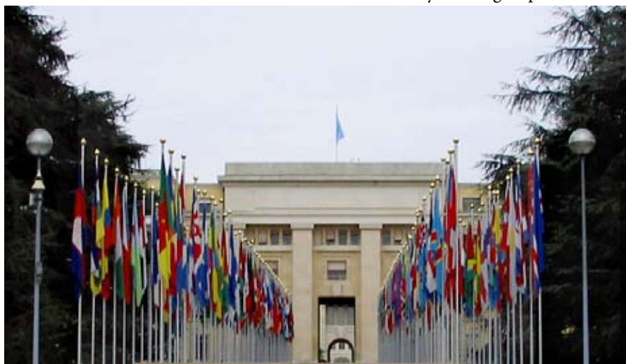
The UN Human Rights Council focused on the situation in Iran in a session on 15 February at the Palace of Nations, the Geneva headquarters of the United Nations.

"It was astounding to those of us in the Council chamber to watch the Iranian delegates stand before the