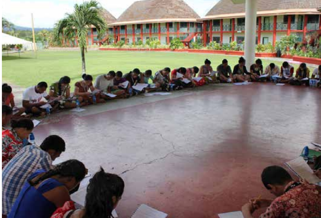
Nearly 350 young people gathered in August in Apia, Samoa, to reflect on their efforts to widen the circle of those contributing to the betterment of their communities.

At the conference in Cali, Colombia, youth drew maps of their neighborhoods and villages, analyzed their needs and opportunities, and planned the next steps. The young representatives from the community of Alegrías, a village of about 2,000 inhabitants, wrote down the names of their closest friends and planned to invite them to a gathering where they