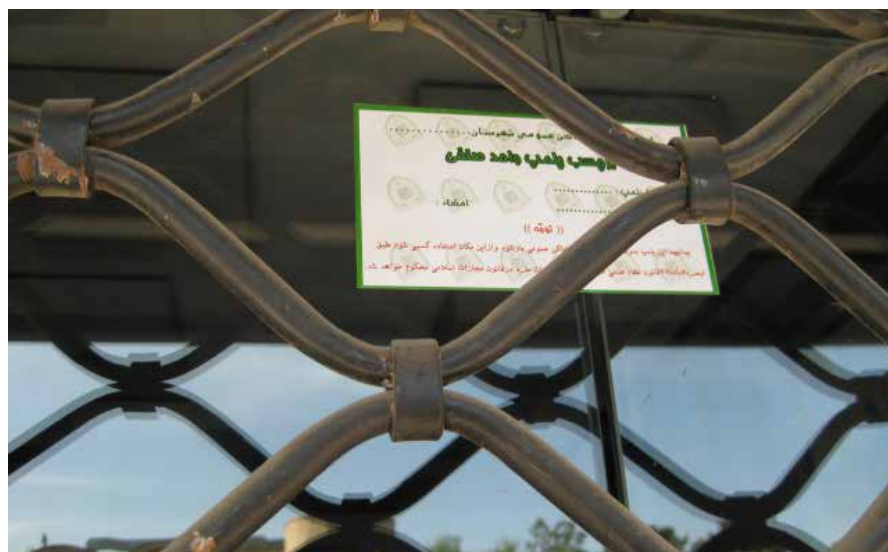
An official notice affixed to the door of a Bahá'í-owned clothing store in Semnan, Iran, declaring it closed.

“The ILO is a tripartite body representing governments, workers, and employers from around the world,”