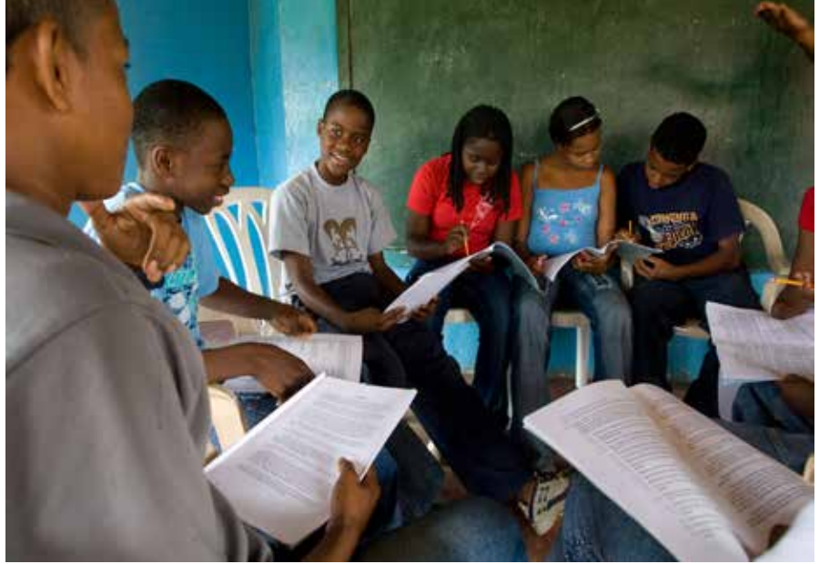
In Norte del Cauca, Colombia, young people participate in a study program designed to encourage them to serve their communities.

Disparities of income and wealth, though far from the only kind of inequity, are another aspect of concern in relation to sustainable development and social harmony. Over 80 per cent of the world's population lives in countries where income differentials are widening. The poorest 40% of the world's population account for five per cent of the global income. Poverty eradication measures, even where finding some measure of success, have failed to address growing disparities in income and unprecedented concentrations of wealth.