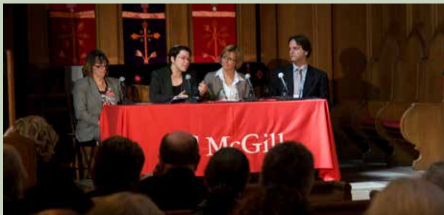
A panel on religion and secularism in Canadian society at McGill University in May.

M ONTREAL—Concerned about the increasing polarization between secularists and religious believers, along with the growing divide between fundamentalists and more liberal followers of every ideology, religious leaders from across Canada joined with scholars and public figures to explore the role of religion in a modern and diverse society here in May.