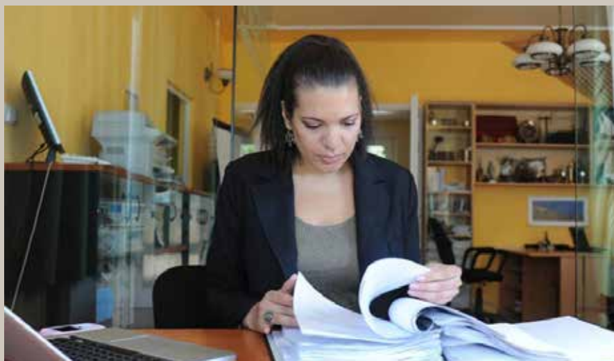
Rita Izsák, the UN Independent Expert on minority issues.

G ENEVA—Four high-level United Nations human rights experts issued a joint statement in May calling on Iran to immediately release the seven imprisoned Bahá’í leaders.