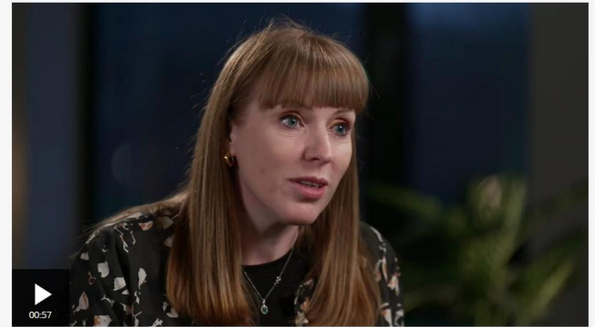
Rayner 'determined' to meet Labour's 1.5m new homes target

Contents Making it easier to bid and work in partnership with the public