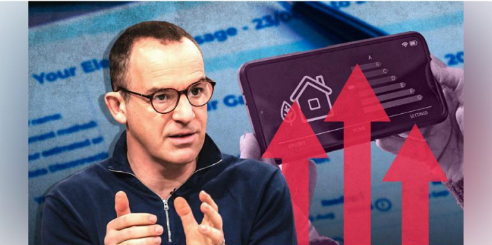
Act now to avoid the hike

According to Martin Lewis , 80% of households in England, Scotland and Wales currently overpay for energy — and in the coming months, it's only going to get worse.