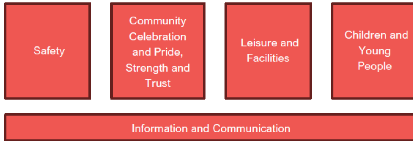
Figure 3. Themes from our Community Listening Survey

Through this, we have gained a unique, detailed perspective and rich insight into the challenges, concerns and hopes of residents for the future of Buckskin and South Ham.