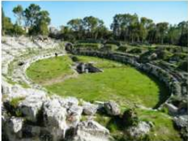
Neapolis Archeological Site