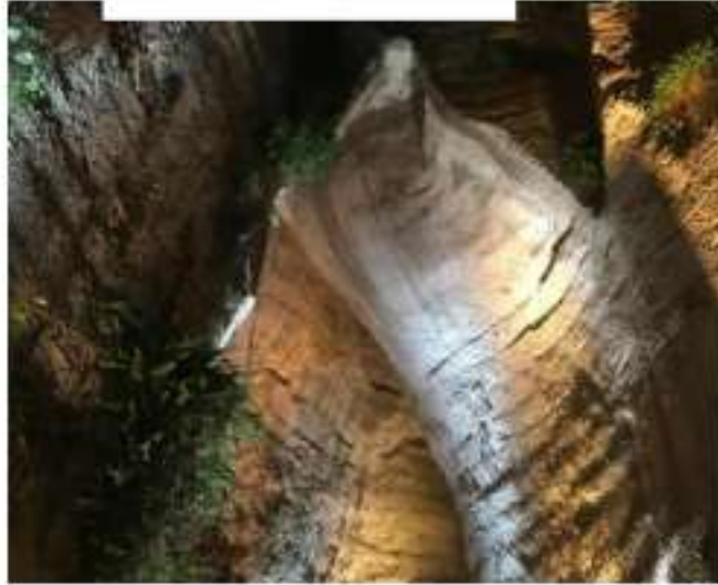
Ear of Dionysus