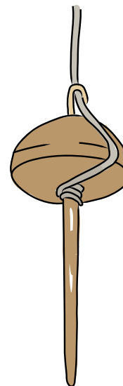
Wind a cop below the whorl.

In classroom settings where there is an emphasis on linguistic learning and fewer opportunities for children who are kinesthetic learners, learning how to spin (or do other handwork) can provide an outlet for untapped potential and help them develop confidence in their abilities. You know how spinning has enriched your life, and when you pass this gift onto another, you're making the world a happier, healthier place!