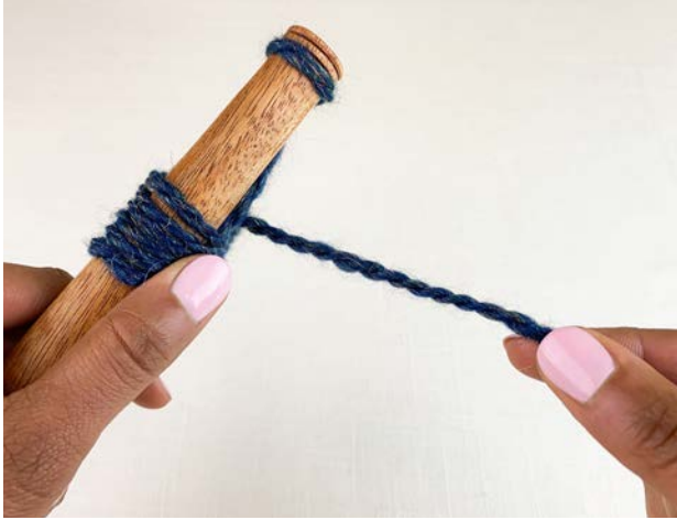
Method Two: Corner to corner

4 Repeat Steps 2 and 3 until finished winding.