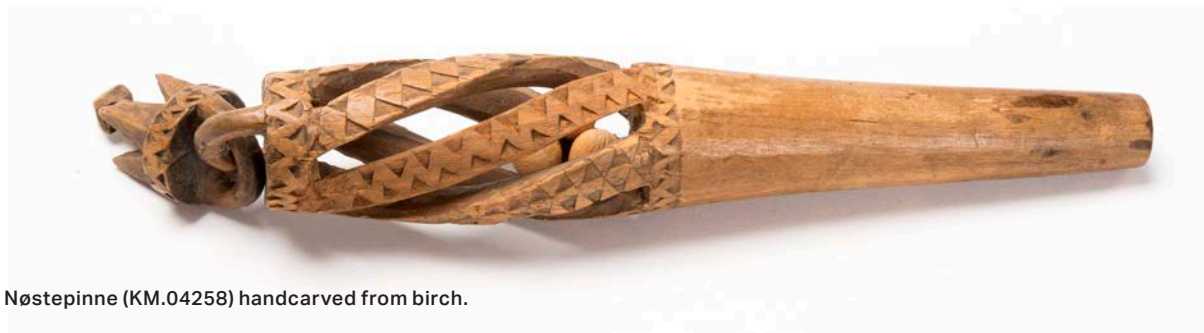
Nøstepinne (KM.04258) handcarved from birch.

Furthermore, I spun five yarns of various fiber content and ply structures. The first was a two-ply 75% baby alpaca and 25% peduncle wild silk yarn, measuring 13 wraps per inch (wpi). The second was a two-ply mixed blend of Merino and trilobal nylon measuring 6 wpi. The third yarn was a not-so-consistent singles with a mixed blend of Merino, Tencel, and other fibers, measuring an average of 11 wpi. The fourth was a two-ply, hand-processed East Friesian wool measuring 8.5 wpi. The final yarn was a three-ply, hand-processed Shetland wool that measured 11 wpi. The winding method for each yarn was chosen at random.