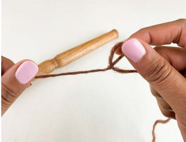
Method One: Keep it rolling

5 Continue Step 4, keeping close watch on the ball as it builds to avoid a lopsided center-pull ball. Note: