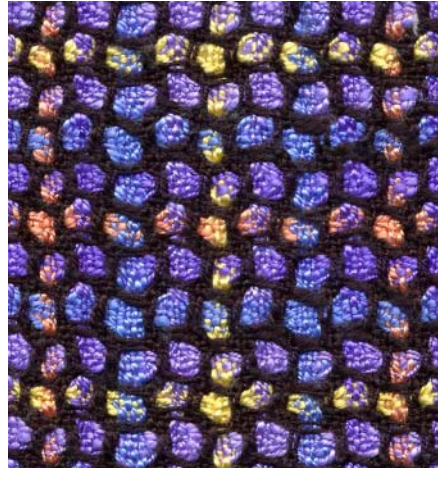
Ruth Morrison's original "mosaic" scarf

into an evening bag to match my perfect scarf. The project instructions given here are for both a bag and a scarf. You can choose to make only one of the two pieces. If you do that, allow a 2½ yd warp length for the bag and 3 yd warp length for a scarf.