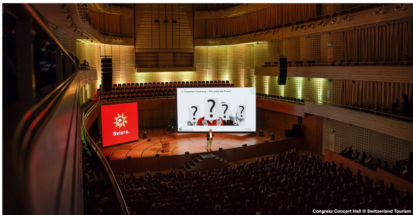
Congress Concert Hall

Suitable for: Congresses, Conferences, Concerts