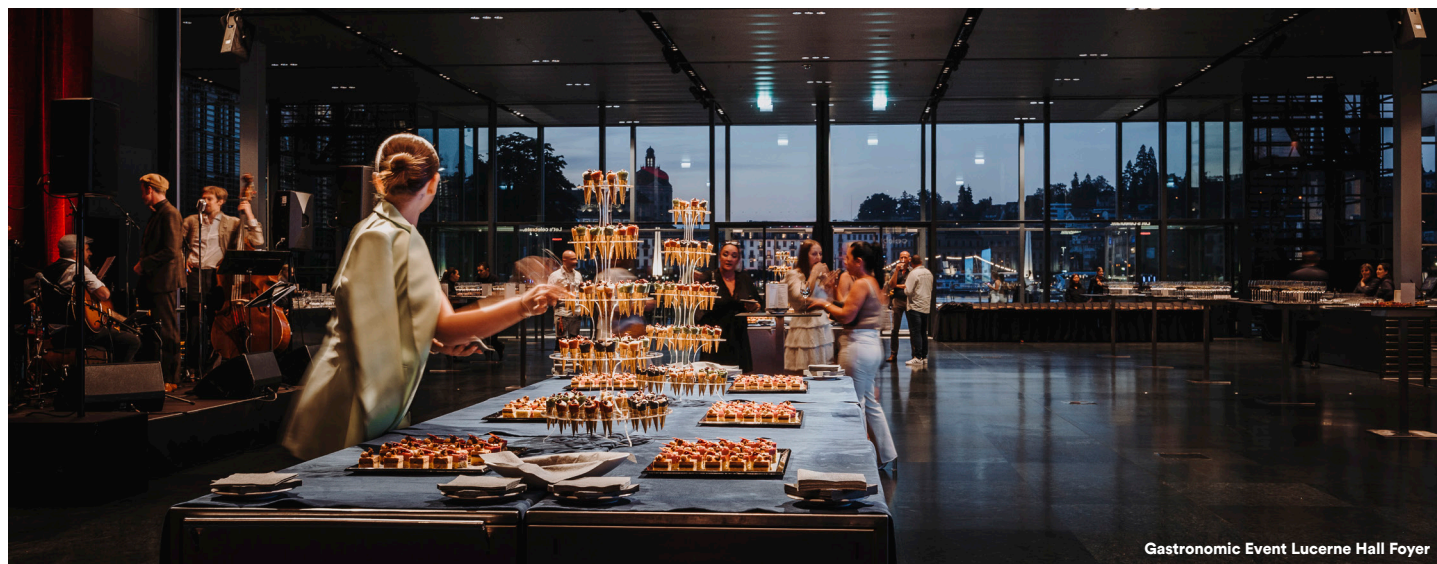
Gastronomic Event Lucerne Hall Foyer