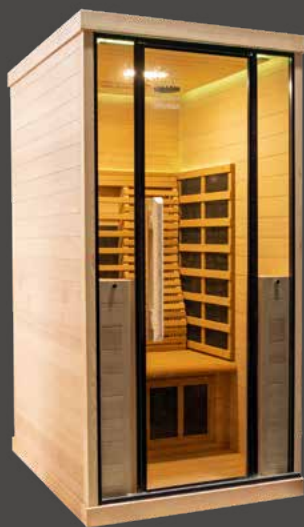
1 Person Prestige Sauna