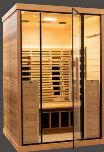
2 Person Prestige Sauna