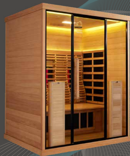
3 Person Prestige Sauna